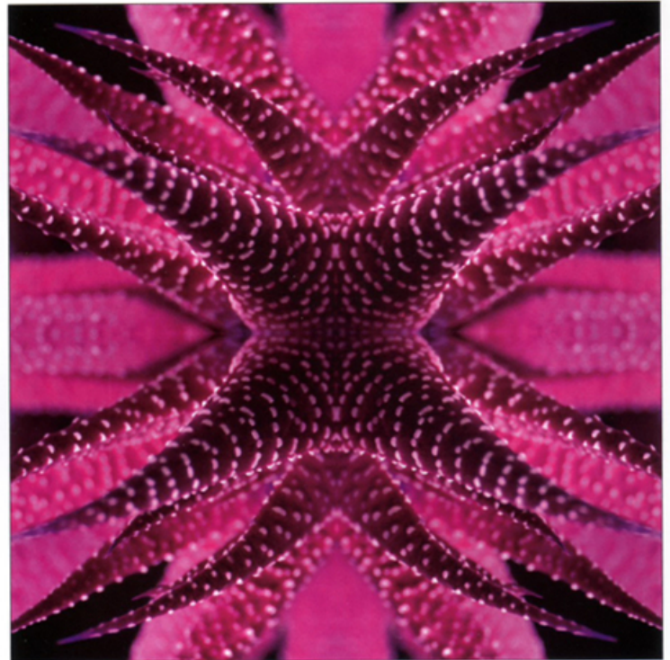
Alien Tentacles , by Rodrigo Pedrolli © Rodrigo Pedrolli, 2005